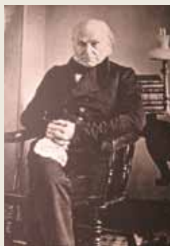
—John Quincy Adams

If your actions inspire others to dream more, learn more, do more and become more, you are a leader.