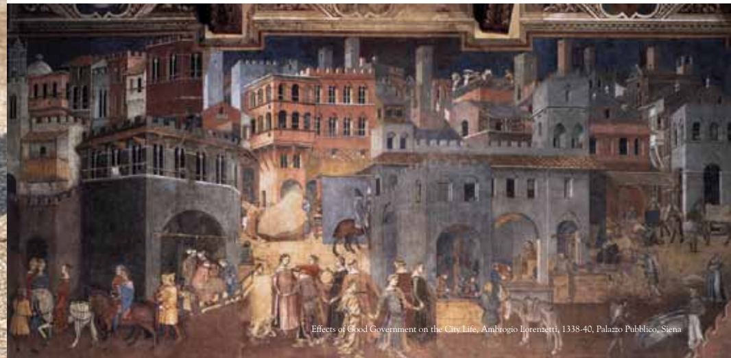
Effects of Good Government on the City Life, Ambrogio Lorenzetti, 1338-40, Palazzo Pubblico, Siena

In all of our work, the Institute is guided by the vision of Ambrogio Lorenzetti (1290–1348), the early renaissance painter of the Sienese school. His masterful work, "Allegory of Good Government: Effects of Good Government in the City and the Countryside," painted in 1338-1339 and pictured below, presents a compelling visual of how good leadership can create a peaceful, prosperous and harmonious society. Lorenzetti also explores the effects of an ill-governed town in another panel. The frescoes are located in the Palazzo Pubblico, Sala dei Nove , in Siena, Italy, and serve as an inspirational point for the leaders we intend to form at the Mount.