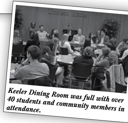
Keeler Dining Room was full with over 40 students and community members in attendance.

Information at your fingertips! Tear off and keep for future reference.