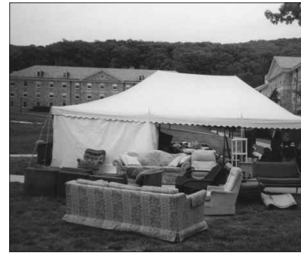
Statistically, college students throw away 640 pounds of trash each year, with a third of the total in the last two weeks prior to clearing out for the summer.

Spring is just around the corner—I spied a few stray daffodils blooming already. Ashes have been imposed. Lent has begun. As we journey through this season of reflection, may we recall the promise of fulfillment inherent in Christ's sacrificial love, and may we strive to undertake our responsibilities with joy.