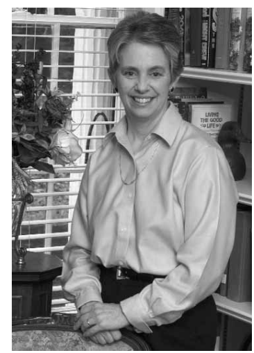
Feel free to contact us with any suggestions, questions or concerns you might have.