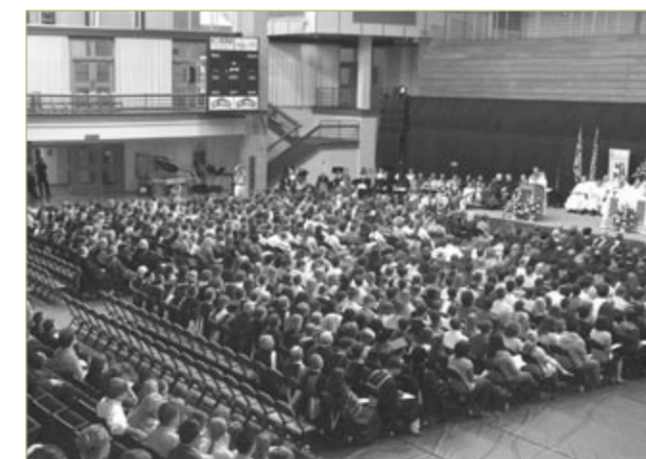
A “swarm” of over 1,000 students, seminarians, faculty, staff, administration, Board of Trustees, alumni and special guests attended this year's Opening Convocation celebrations.

As we launch this historic Bicentennial school year, I hope you keep informed of many special opportunities for celebration. In this issue, on our website and through the monthly “Around the Mount” e-newsletter notices you will learn of the exciting events in store for this year. I hope to see you at FamilyFest, September 21-23 which promises to be especially festive this year! By the way, this weekend series of events is not just for families of First Year students, but offers opportunities for engagement throughout a family's association with the Mount. Visits with faculty and the chance to learn about International Travel, Service trips and Internships often become more important in the later years.