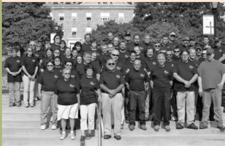
The physical plant staff implemented over 30 campus construction projects this past summer.

At the completion of all of these projects dictated by the campus master plan, students, parents and alumni alike returning to the Mount will be pleasantly surprised by the new, fresh look as we move into our third century of existence.