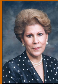
Novello was appointed Surgeon General by President George H. W. Bush, beginning her tenure on March 9, 1990. She was the first woman and the first Hispanic to hold the position.

For more on Famous Firsts by these or other Hispanic Americans, visit FactMonster.com