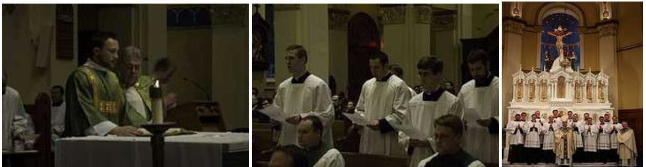
Oath of Fidelity/Profession of Faith, Chapel of the Immaculate Conception