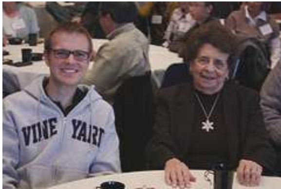
Seminary Family Weekend, Fall 2010