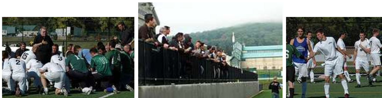
Fall 2010 Vianney Cup – Inter-Seminary Soccer Tournament, ARCC Athletic Complex

Mount St. Mary's provides a variety of facilities for individual or group recreation with various outdoor courts, fields, an extensive intramural/club sports program, and the Knott Athletic Recreation Convocation Complex. Further information about the ARCC and the athletic recreation programs is available on the Mount St. Mary's University website ( www.msmary.edu ).