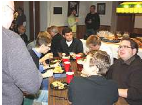
House parties in the Seminary Recreation Room