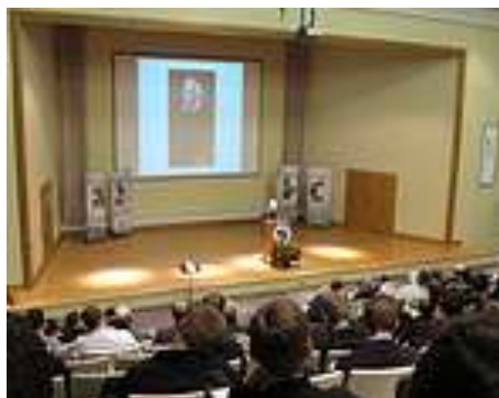
Blessed John Henry Newman Symposium, Knott Auditorium