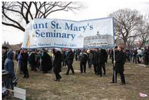
March for Life, Washington, D.C.