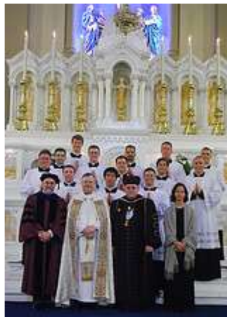
2010 Seminary Closing Ceremony, Chapel of the Immaculate Conception