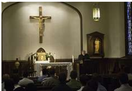
St. Bernard's Chapel, McSweeney Hall