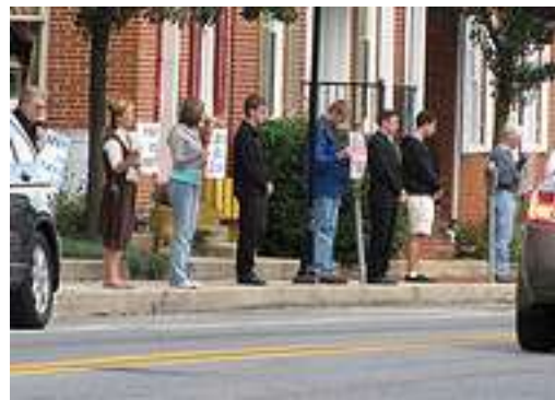
Life Chain, Emmitsburg, MD