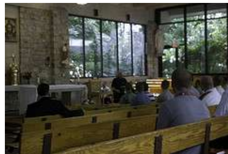
Glass Chapel, Grotto of Lourdes