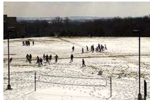
Echo Field, after a light snow fall