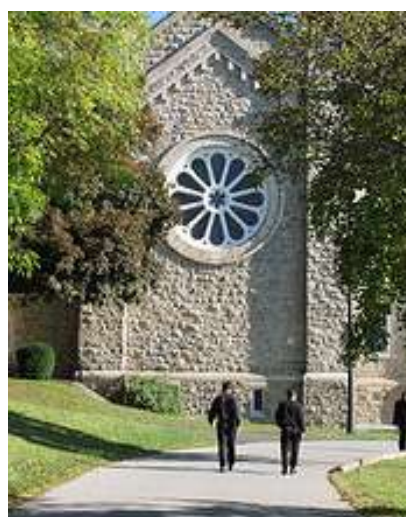
Chapel of the Immaculate Conception