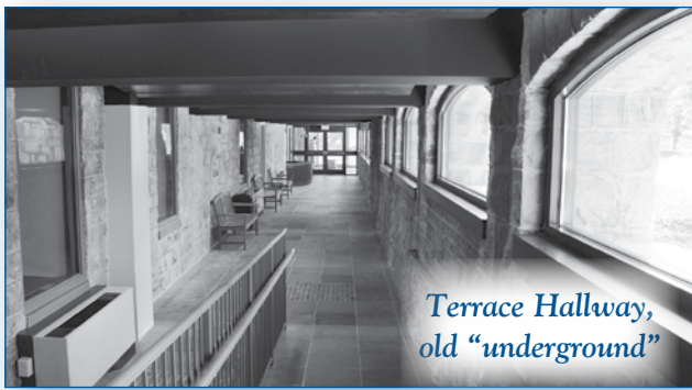
Terrace Hallway, old "underground"